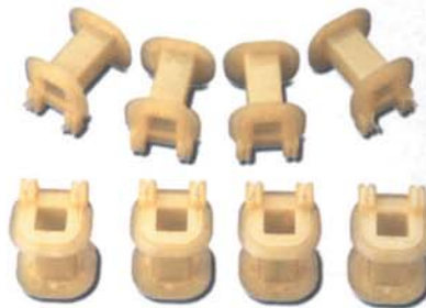
4 Cavity "Bobbin" 33% Glass Filled Nylon